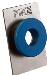
Heavy-Duty Magnetic Film Holder