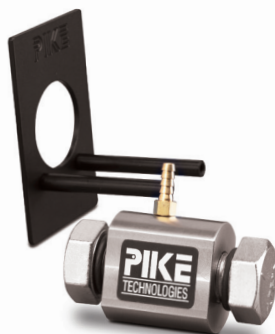
Bolt Press and Gas Cell Holders

The Universal Sample Holders feature a spring-loaded mechanism which conveniently keeps in place films, salt plates, KBr pellets and other materials. The clear aperture of the holders is 20 mm and 10 mm. This universal holder offers great sample mounting flexibility.