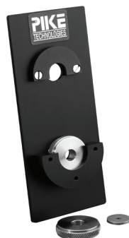
Dual Pellet Holder