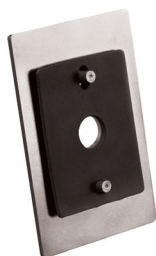
Magnetic Film/Pellet Holder