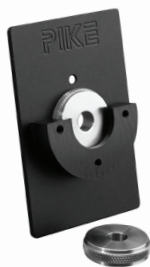
Single Pellet Holder