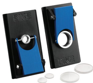
Universal Sample Holder

All PIKE Technologies transmission holders are constructed of high-quality materials and feature a 2" x 3" standard slide mount compatible with all FTIR spectrometers.