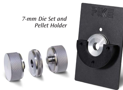
7-mm Die Set and Pellet Holder

The comprehensive Pixie Package provides all necessary components to start making pellets in the lab. It includes a 7-mm die, two extra pellet collars, pellet holder, pestle and mortar set, KBr powder and spatula. All die components are made of hardened stainless steel and the parallel surfaces that come in contact with the sample are highly polished for obtaining optimal pellet quality.